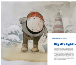
Big Al's Lighthouse

The books are priced at €10.00 with all proceeds directly supporting the work of Children in Ireland (85%) and Northern Ireland Hospice (15%). Click here to purchase your copy.