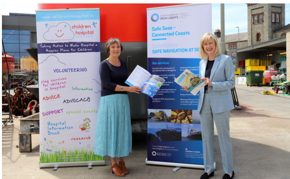
Commissioner of Irish Lights publish Lighthouse Story book - proceeds to Children in Hospital