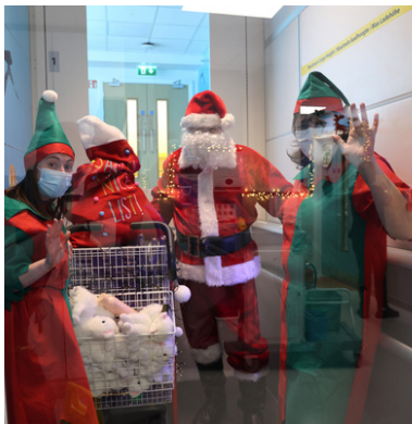
Annual Christmas Appeal