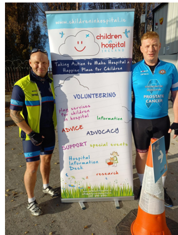
Dublin Fire Brigade Cycle